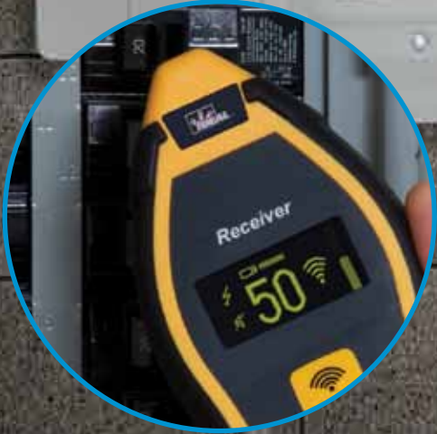
Receiver identifies the correct circuit to which the transmitter is connected.