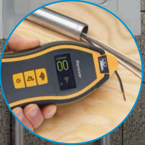
Individual wires can be sorted, opens can be located and shorts can be isolated.