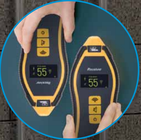
Revolutionary technology in the RC-959 rotates the display in 90° increments so that you always receive an upright reading. Even when the receiver is pointing down, you can keep up.