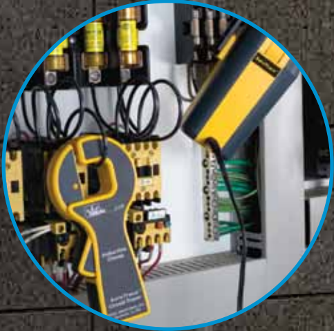
Inductive clamp allows you to induce a tracer signal on to the cable without affecting the low voltage signals on the circuit.